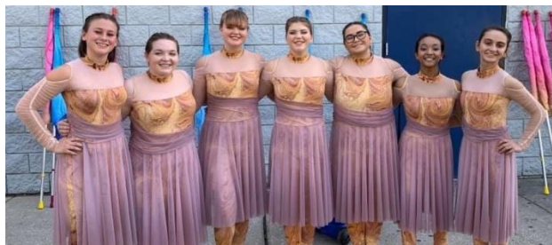
Warrior Winter Color Guard