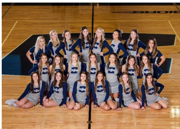
Warrior Competitive Cheer Team 2020 FHSAA Region 3 Champions

Registration Fee Discount for Re- Enrollment for the 2020-21 School Year Ends on Thursday, February 13th