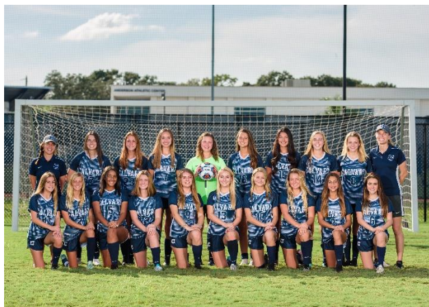
2019-20 Lady Warrior Soccer Team